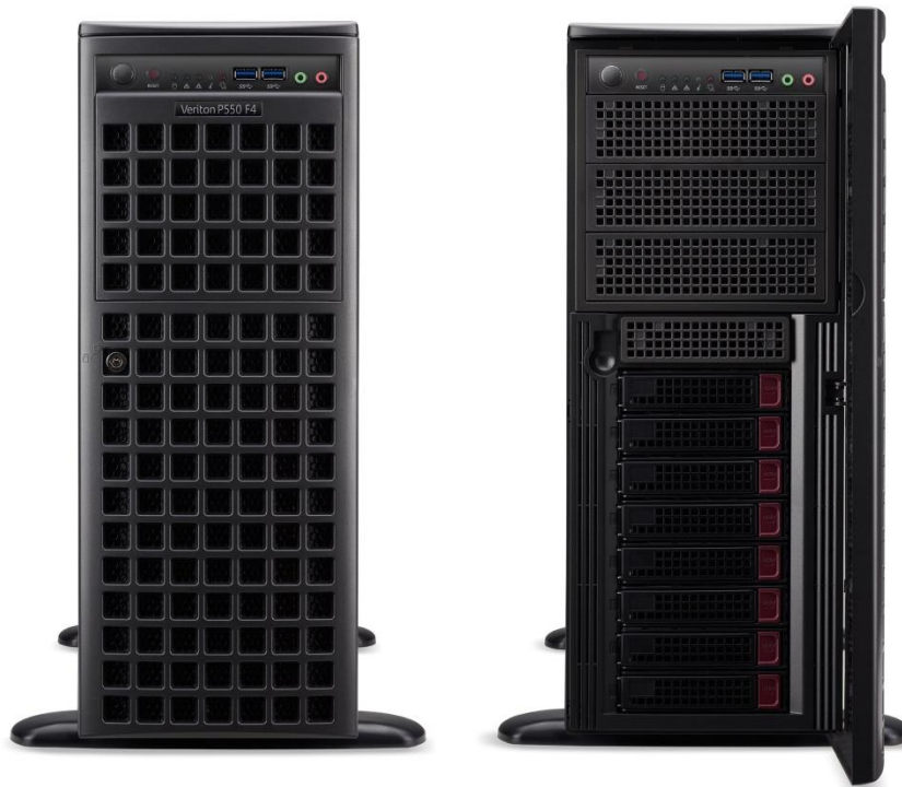
Front I/O Ports